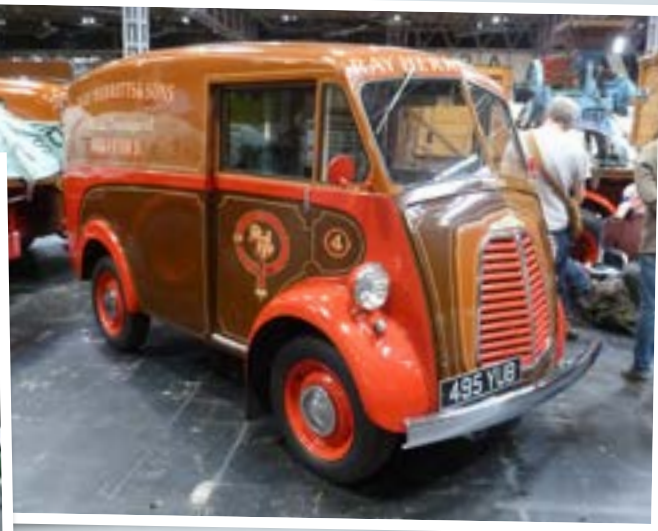
Two examples of the Morris Commercial J Type 10cwt

"But the vehicles never stopped appearing - one lorry or van after the next. Then I got to an age where I was helping to feed dad's habit of collecting historic vehicles.