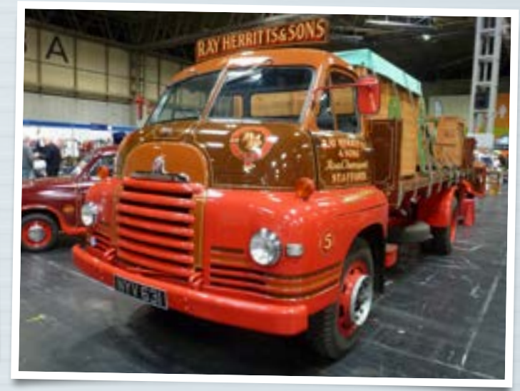
S Type Bedford