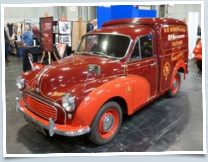
Morris Minor 5cwt Van