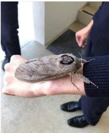
Rare baby giant flying haggis born in captivity at the Edinburgh Zoo.

I found the above picture amusing because of the lack of punctuation. I read it as dead children would be slow to cross the road.